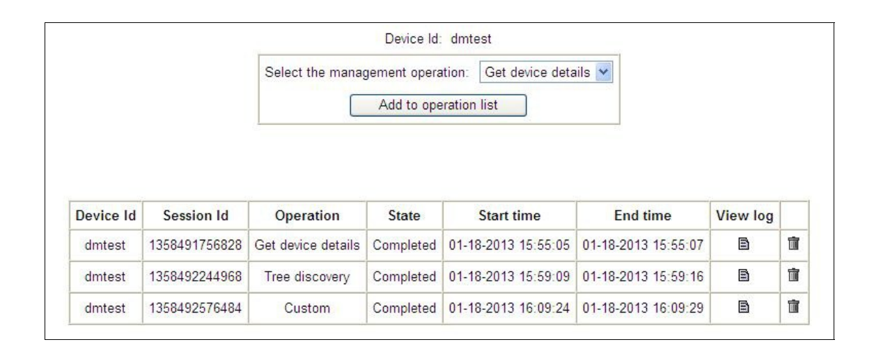
Funambol DM Server DMDemo User's Guide

5. Click the icon in the View log column. This displays the Results and Status Code columns.