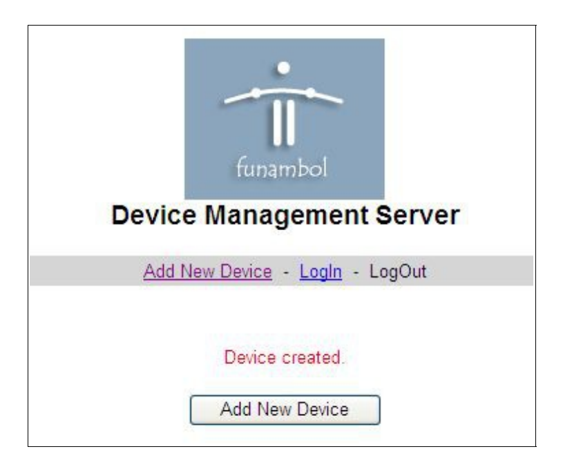
Funambol DM Server DMDemo User's Guide